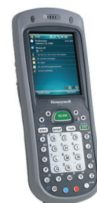
Dolphin 7600 Data Collector

remotely. With the SIMMS Windows Mobile Program, you have the flexibility to choose your hardware and your budget.