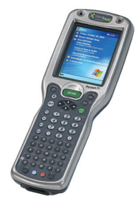
Dolphin 9500 Data Collector